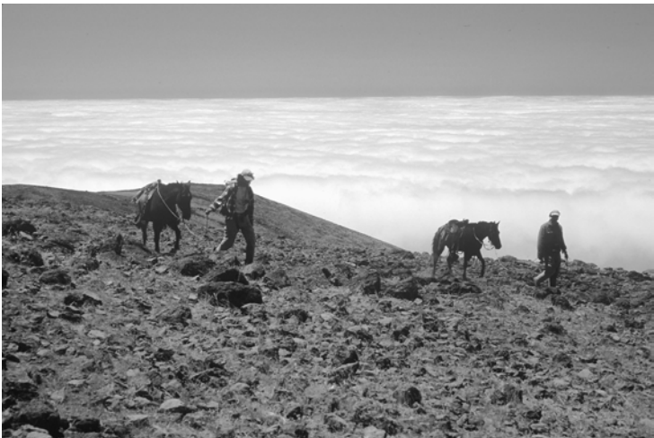
ICEG researchers and Mexican horses above the clouds in the northwestern portion of Guadalupe Island. The endemic mint ( Satureja palmeri ) that was thought to be extinct was rediscovered in this area.

Unfortunately, feral goats that were introduced to Guadalupe in the 1800s have drastically altered the island's ecosystems. Once-extensive stands of endemic cypress, palm, and pine trees, as well as groves of junipers and Island Oak, have been dramatically reduced and non-native plants have invaded large areas. Although some goats have been removed from the island recently, extensive erosion has taken place, and at least 20 native plant species may have been eliminated.