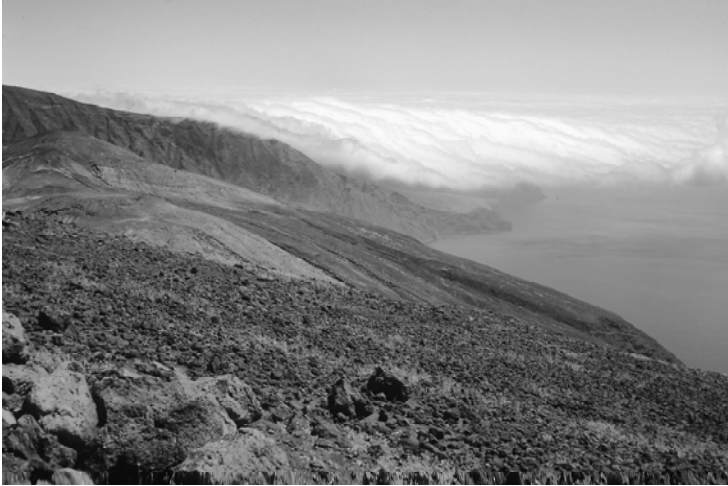
Barren landscape on the northeastern side of Guadalupe Island. In spite of the feral goats, a few native annual plants survive amongst the volcanic rocks.

An exciting cooperative project on the most isolated island in the California Floristic Province has begun to yield results. In 2001 the Island Conservation and Ecology Group (ICEG), a non-profit organization associated with UC Santa Cruz, asked for the Santa Barbara Botanic Garden's help in protecting native plants on Guadalupe Island.