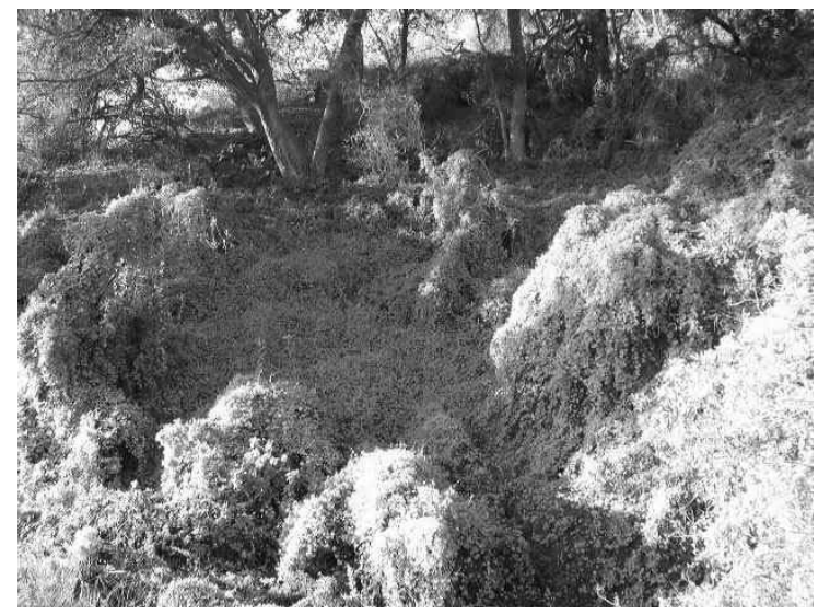
Cape Ivy has entirely covered every native plants under the canopy of the Coast Live Oak trees here on the east side of East Casitas Pass. This was not here in 2001, and has spread very fast since then.