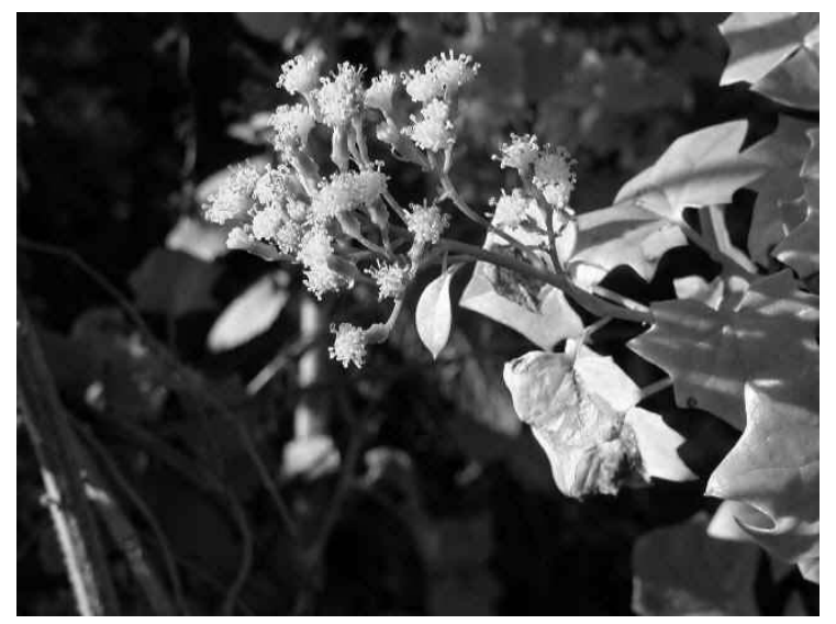
This is a close-up of the leaves and flowers of Cape Ivy. It twines itself onto and over other plants for support. The leaves are bright green and the flowers are yellow.

The invasion is spreading like a cancer, much faster then any of us feared. Cape [German] Ivy ( Senecio mikanioides ), a vigorous perennial evergreen vine from South Africa, is smothering the native vegetation along State Route 150 in the on both sides of East Casitas Pass. If was first observed on the west side of the Pass sometime in 1998 and spreading somewhat by 2002 to both sides of the Pass. However, by last December it as started filling many of the little draws along the highway towards Lake Casitas. It especially likes to grow in shaded areas on north-facing slopes, and clambering over anything in its path, smothering, and killing whatever is under it by preventing enough light to reach the leaves of its "host" plant. Something really needs to be done to control this invasive weedy vine or it will take over hundreds of acres of our native chaparral, coastal sage scrub, and riparian habitats.