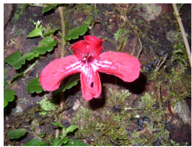
Schizanthus hookeri, Cochamó Valley, Chile