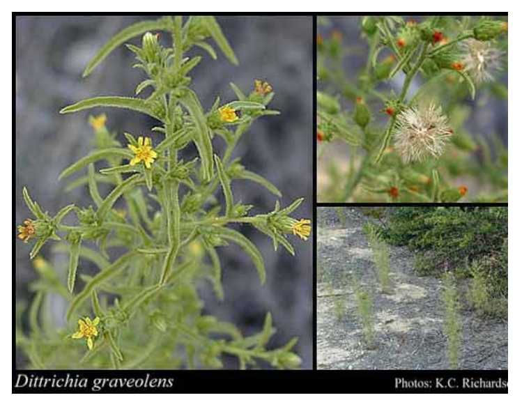
Accessed on Tuesday, 18 January 2005.

A new weed from the Mediterranean region and Asia Minor has been reported for Ventura County: Stinkwort ( Dittrichia graveolens ). Stinkwort is an aggressive annual plant in the Sunflower family (Asteraceae). It was recently reported from the Santa Clara River Valley near Piru. This plant is considered a Noxious weed by the U.S. Department of Agriculture and should be eradicated from any place it is found. It has been previously reported in California from Solano, Contra Costa, Santa Clara, and Madera Counties.