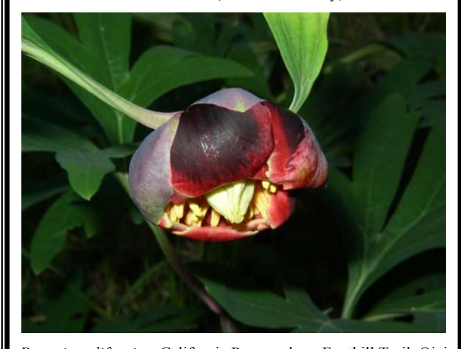
Paeonia californica, California Peony, along Foothill Trail, Ojai

See these photos in color by downloading this newsletter from the www.cnpsci.org