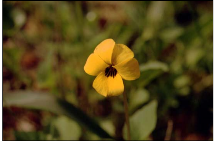
Viola pedunculata spp. pedunculata (Johnny-jump-up)

Directions to the E.P. Foster Library : from the North on US101 take Ventura Ave exit, go straight 2 blocks and turn Right onto Main St.; go 6 blocks East and turn Left onto Chestnut St. From South on US101 take the California St. exit; go 2 blocks and turn Right onto Main St. and turn Left onto Chestnut. Parking is located behind the library, and there is a rear entrance to the Topping Room , on the West side of the library. 651 E. Main St.