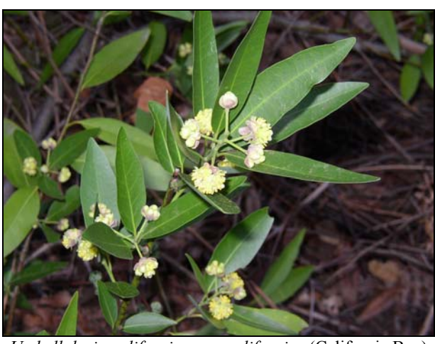
Umbellularia californica var. californica (California Bay)

Saturday, 16 September 2006, 9:00 am. Sponsored by the California Coastal Conservancy.