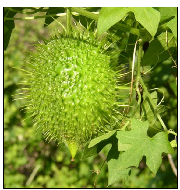
Marah macrocarpus var. macrocarpus (Large-fruited Man-root)