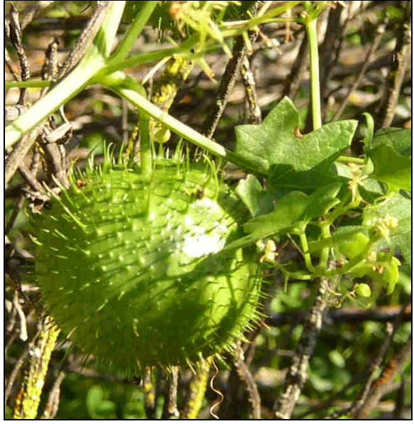
Marah fabaceus var. agrestis (California Man-root)