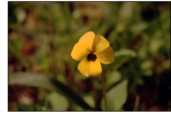
Viola pedunculata spp. pedunculata (Johnny-Jump-Up)

My favorite plant of the season is Viola pedunculata ssp. pedunculata (Johnny-Jump-Up), which is a perennial herb in the Violet Family (Violaceae). This puberulent plant comes from a deep rhizome with cauline, triangular-shaped leaves and orange-yellow petals baring reddish-brown markings. Johnny-Jump-Ups can be discovered in open, undisturbed, grassy hillsides growing amongst Wildflower Field or Oak Woodland habitats. I grow violets at home, but nothing compares to the delicate nature of these little beauties, and the pristine habitat they usually occur in.