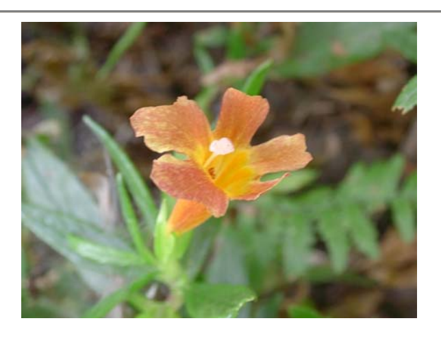
Mimulus flemingii X M. aurantiacus? Island Monkeyflower hybrid near Pelican Bay, Santa Cruz Island.